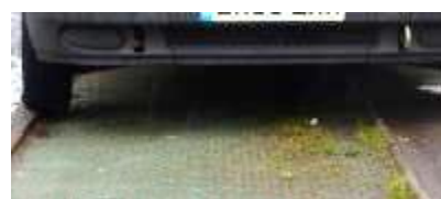
Poolemead Road – roadside left to deteriorate