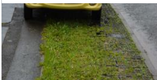
Haycombe Drive – grasscrete protects the roadside

If you go into Whiteway you see grasscrete installed all around Haycombe Drive, which protects the roadside verges. But go down into Poolemead Road and you see a stretch of roadside that's left to deteriorate.